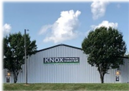
Extension Campus 1481 Yauger Road Mount Vernon, OH 43050