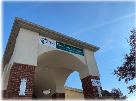
Main Campus 308 Martinsburg Road Mount Vernon, OH 43050