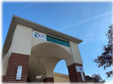
Main Campus 308 Martinsburg Road Mount Vernon, OH 43050