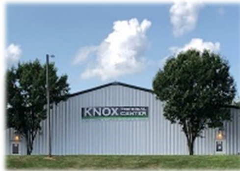
Extension Campus 1481 Yaeger Road Mount Vernon, OH 43050